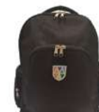
BLACK BAGPACK WITH LOGO FS1-YEAR13