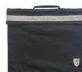
BLACK BOOKBAG WITH LOGO FS1-YEAR6