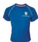
P.E. T-SHIRT BOYS & GIRLS FS1-YEAR 6