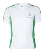
P.E. T-SHIRT BOYS & GIRLS FS1-YEAR 6