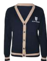
NAVY BLUE CARDIGAN GIRLS FS1 - YEAR 4