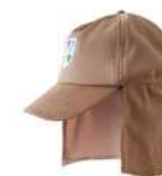
LEGIONNAIRE CAP FS1-YEAR6