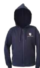
FLEECE HOODY BOYS & GIRLS FS1 - YEAR 6