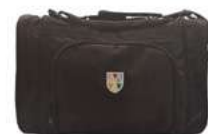
SPORTS BAG WITH LOGO FS1-YEAR13