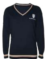
V-NECK SWEATER WITH PIPING BOYS & GIRLS FS1 - YEAR 6